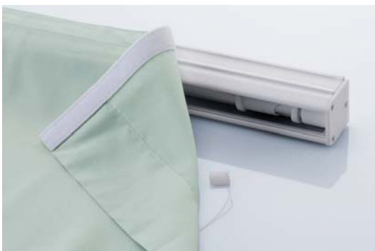
Velcro tape for simple take off