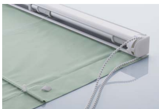
Removable pins for easy cleaning