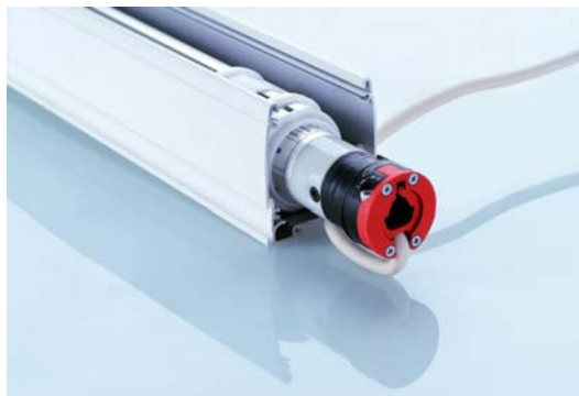
First Silent Gliss roman blind system using a tubular motor