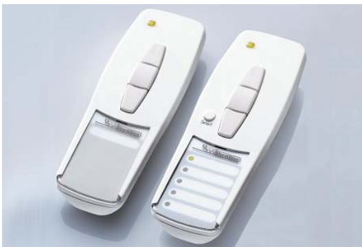
Can be combined and operated with the Remote Control System Silent Gliss 9940